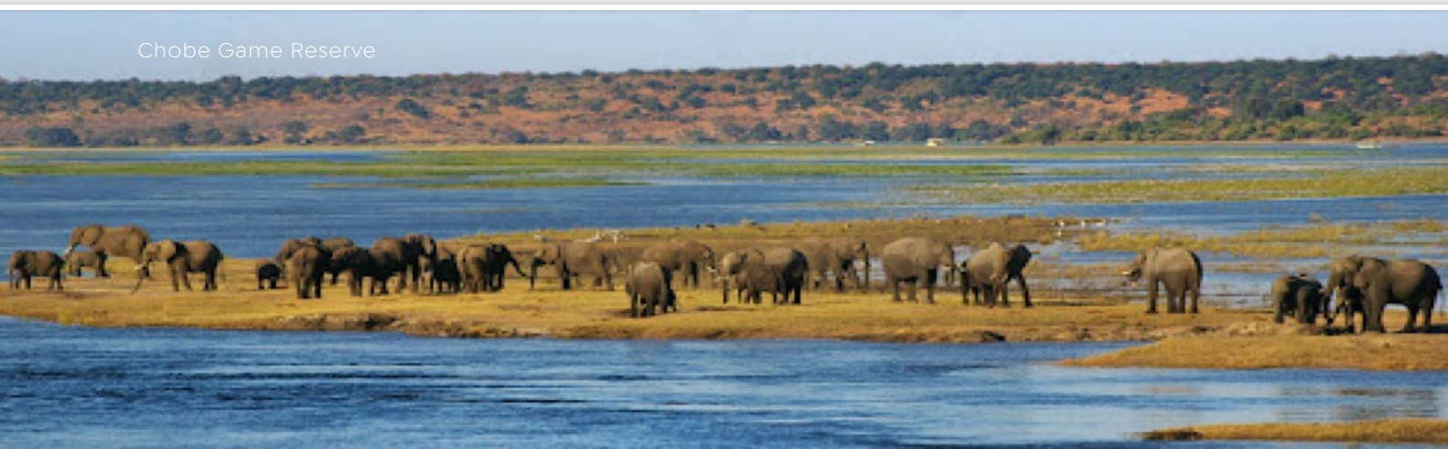
Chobe Game Reserve