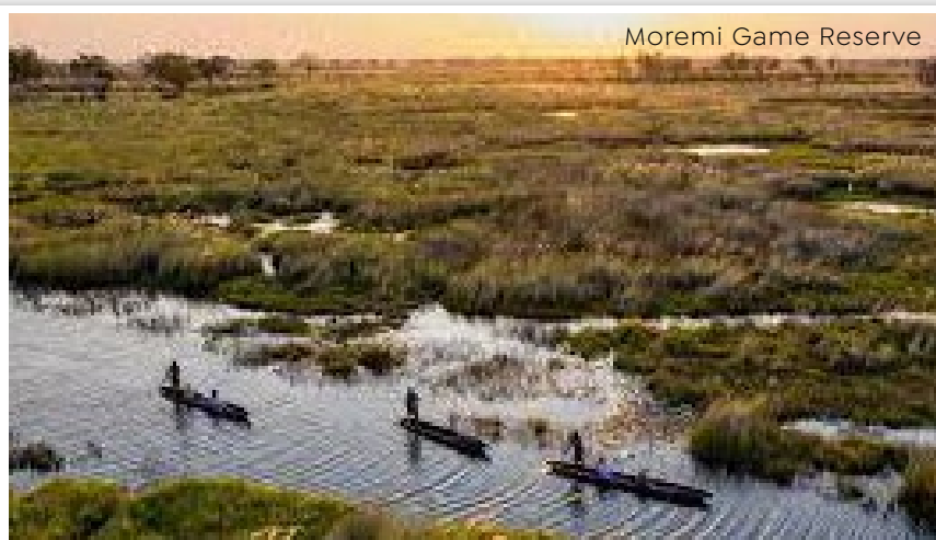
Moremi Game Reserve